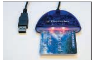
Kit No. 2 (USB) Memory Card reader for Clarus Control