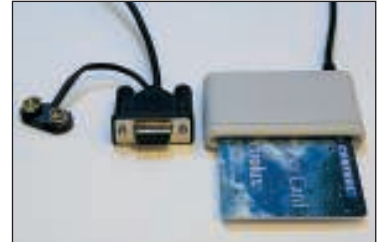
Kit No. 1 (RS232) Memory Card reader for Clarus Control